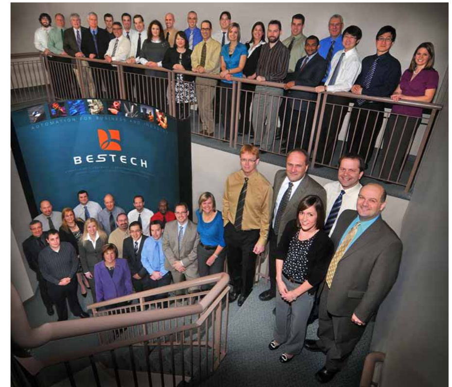
BESTECH Team Photo

Already, this portfolio of products is generating around half of BESTECH’s income and has unlimited potential. For mines and smelting plants in North America, the legal obligations already exist and mines have no option but to comply in one way or another, presenting BESTECH