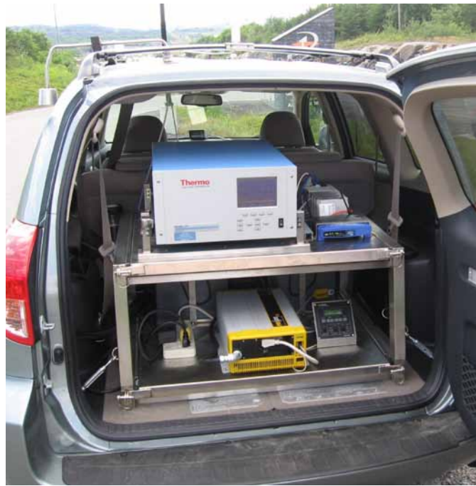
BESTECH's SO2 mobile unit is capable of providing real time readings to operators and the public web site. The system is used to confirm public air quality complaints

authorities can get real time access to the data which makes their supervisory role more effective and timely.”