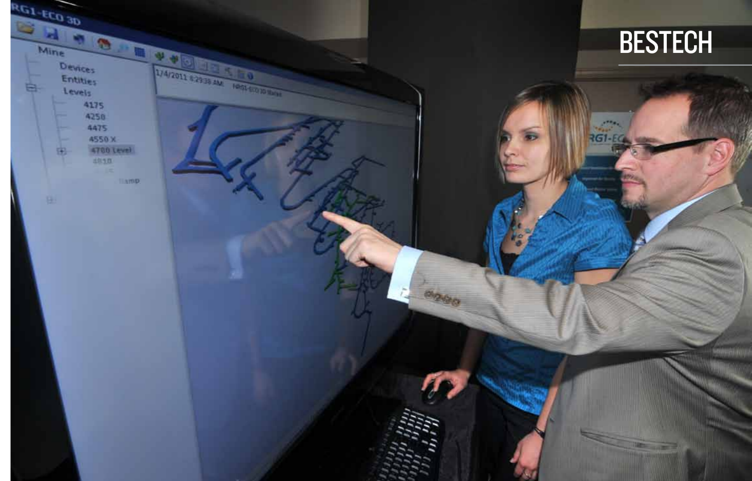
NRGI-ECO.™ 3D viewer-zones within the NRG1-ECO system are displayed in the 3D viewer using customizable colours. Devices are shown in their true geographical positions

Every installation will be different, depending on the relationship between the source of contamination, its relationship to residents in the area and the geographical peculiarities of the site. With a good strong flow of wind, contaminants can be dispersed quickly and with very little impact on the surrounding population. However, certain places are more prone to meteorological inversions which bring the smoke plume back down to earth, requiring action on the part of the plant operators.